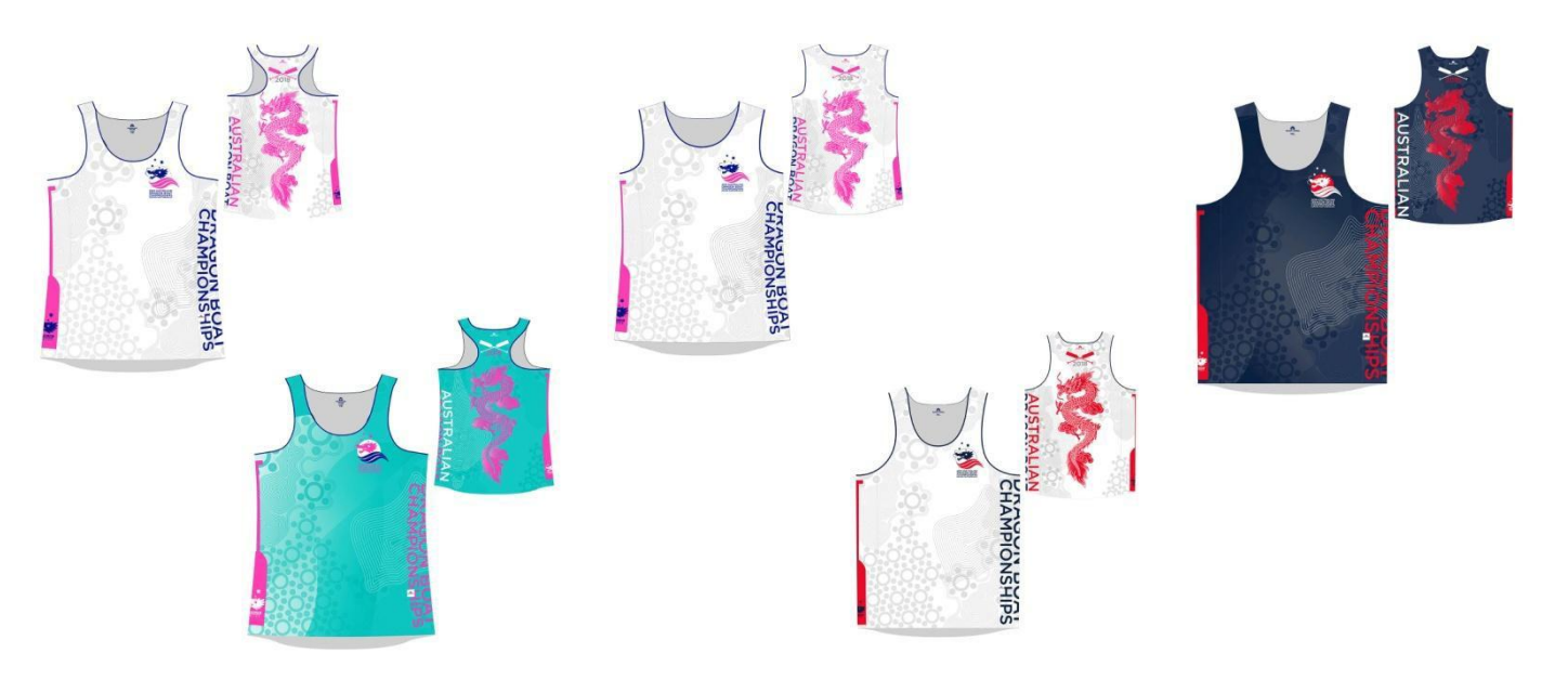
Bulletin No 2 - 2018 Australian Dragon Boat Championships

Team Elite will have a full range of merchandise available for the Championships both online in the run-up to the event, and also at their Merchandise Superstore at the event. The range includes sublimated singlets, printed singlets, 'names' T's and Hoodies, Jackets, Baseball Caps, Key Rings, Stubby coolers and various leisure wear garments. Online sales will be available very shortly - keep an eye on the Team Elite online AUSDBF store (link below) and Facebook postings from AUSDBF and Team Elite. <u>https://shop.teamelite.com.au/collections/ausdbf-online-store</u>